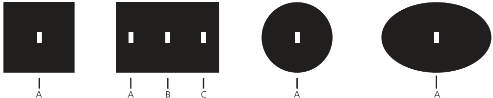
Table Top Power Locations